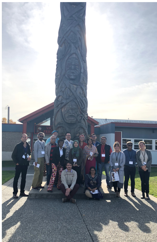
Cohort II out front of the Victoria Native Friendship Centre after their field visits to various CBR sites in Victoria, BC.

Over 21 weeks, mentors embark on a learning journey comprised of 3 primary components: online learning activities, a two week face-to-face learning component, and a field work component to be carried out locally under the guidance of a local supervisor.