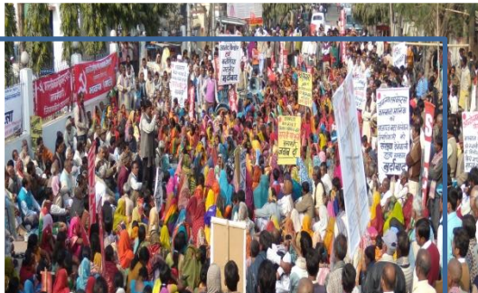
Empowering Civil Society