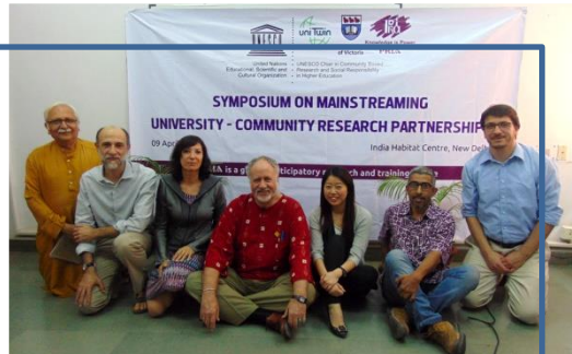
UNESCO Chair in CBR