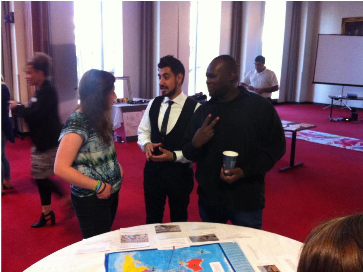
UNESCO Chair in Community Based Research and Social Responsibility in Higher Education