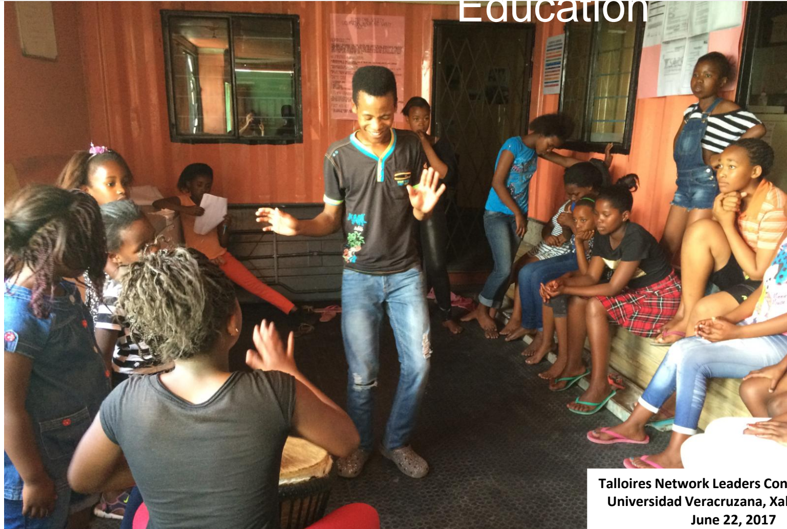
Talloires Network Leaders Conference 2017 Universidad Veracruzana, Xalapa Mexico June 22, 2017