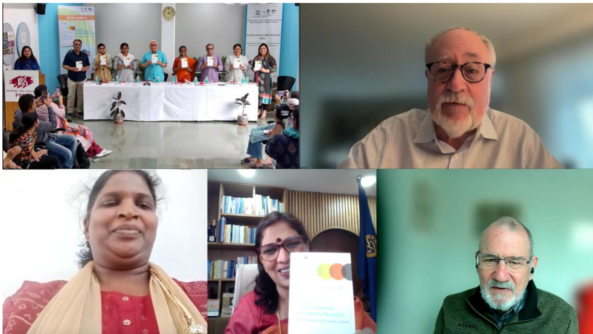
The Hybrid launch of the book- Teaching Community-Based Participatory Research: Socially Responsible and Ethically Anchored , at PRIA