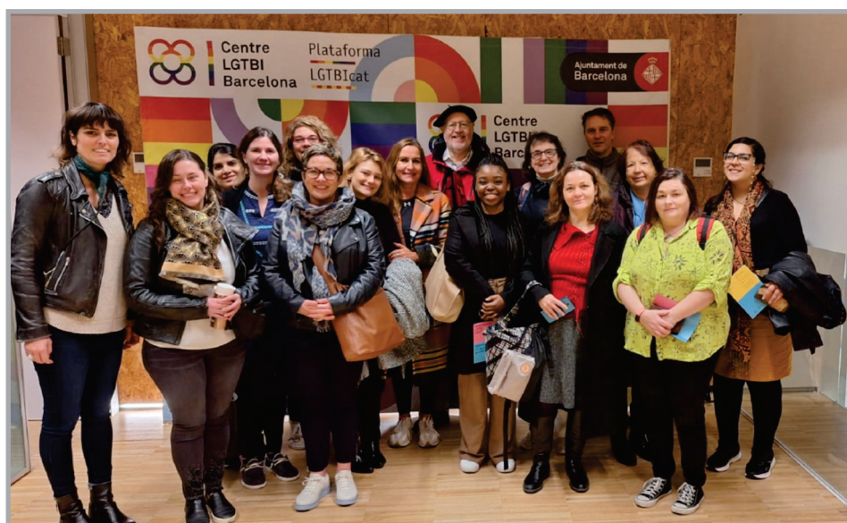
MTP Residency in Barcelona, February 2024

With the recent move towards regionalization of MTP, regional training centers have been created in Southeast Asia, Africa and Latin America that will be delivering MTPs in their respective regions. Similar regionalization efforts are also underway in North America and Europe.